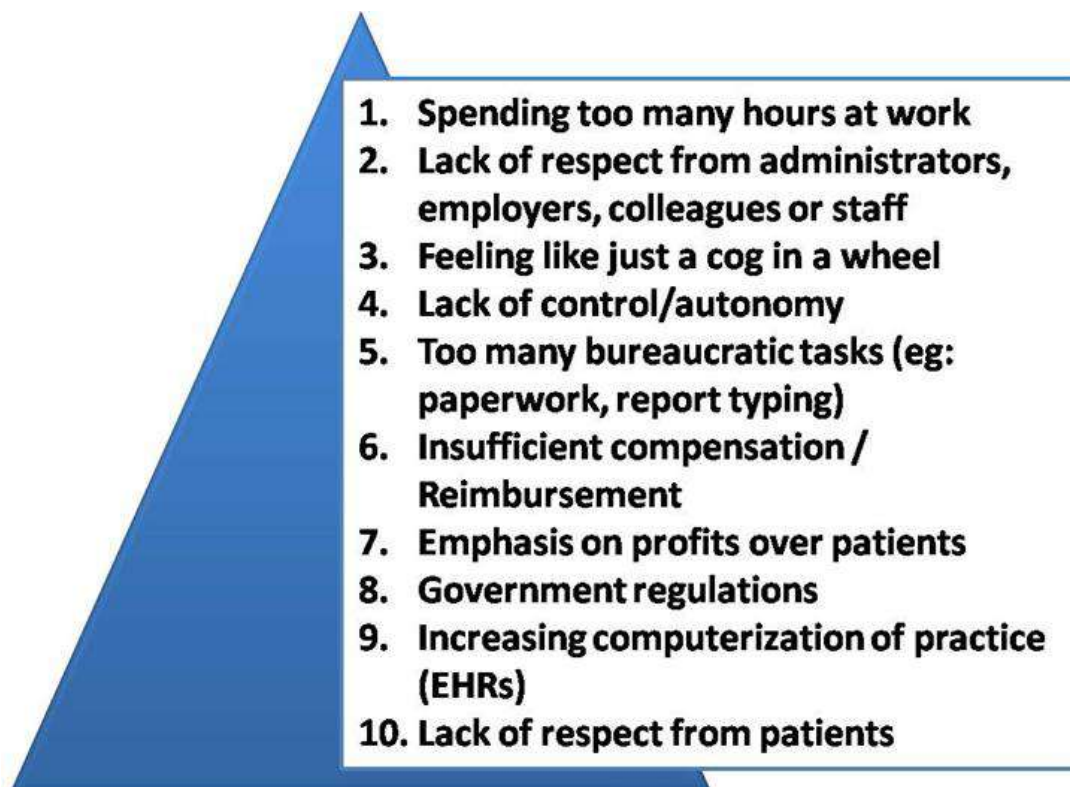
Fig 1: Factor Contributing Radiologist's Burnout (23)

Burnout can affect a radiologist's own psychological and physical wellbeing, which prompts a possible effect on the strength of the patient. At the point when somebody is encountering burnout, they may make more mistakes or not be as gainful as needed [17]. That prompts possible patient injury or misdiagnosis or cost factors for institution. On head of making blunders in persistent treatment, burnout can lead people to: Take part in amateurish conduct, Examine self-destruction or self-hurt, be missing from work more than typical or Resign early or change career [18]. In extreme cases its lead to suicidal tendencies. The Fig 1 and 2 demonstrates the important factors contributing radiologist's burnout and things they do to manage situation respectively.