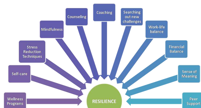
Fig 4: Diagram illustrates strategies that may help in building resilience against burnout [25].

A radiologist can lessen their own possibility of burnout by creating positive psychology within. Like all health problems, identifying issues of stress and burnout early and taking appropriate actions are key to resolving them. The methods like mindfulness meditation, music, aikido, yoga, running and spending time with friends and family, are effectiveness in reducing depression, anxiety, and stress; thereby improving quality of life, physical functioning and improved well-being among radiology professionals. Radiologist can create solid self-care propensities, getting much needed rest and working with others to make a positive group cultures that enables all wellbeing. One may need to stay flexible and be open-minded to try different things in order to find what works for each individual radiologist to achieve a healthier work environment and resilience as an end goal (Fig 4).