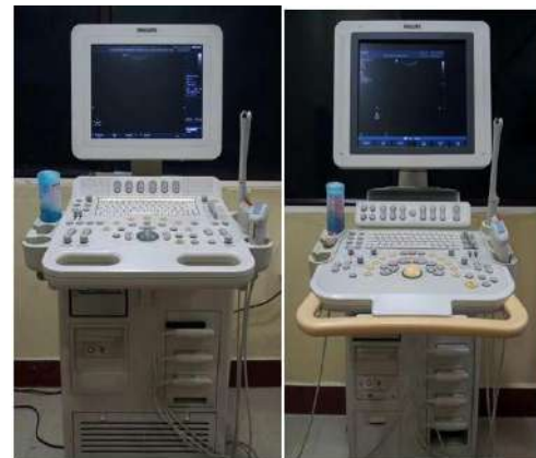
Fig 1: Instruments used Philips HD-6 Ultrasound machine Philips HD-11 XE Machine