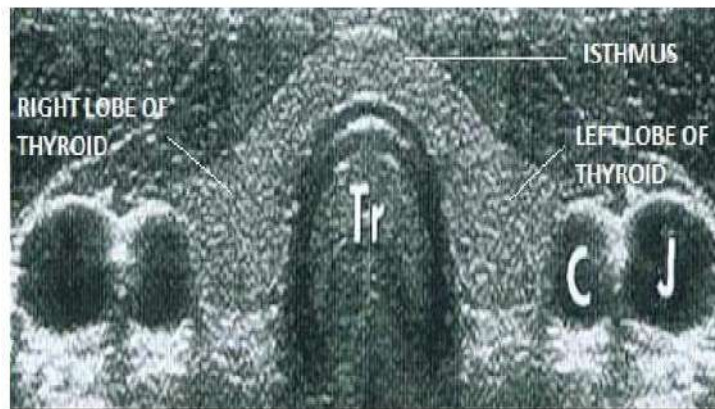
Fig 2: US picture of Normal thyroid [C –Common carotid artery and J – Jugular vein]

There was 2 case of haemorrhagic cyst which was correctly diagnosed on ultrasound (100%). Out of the 2 cases (50%) of malignant etiology of thyroid (papillary) suggested on ultrasound one cases was correctly diagnosed as papillary carcinoma of thyroid. Out of 10 cases of Hashimoto’s thyroiditis (diffuse thyroid disease), 8 cases were correctly diagnosed and the one misdiagnosed cases proved to be multinodular goiters.