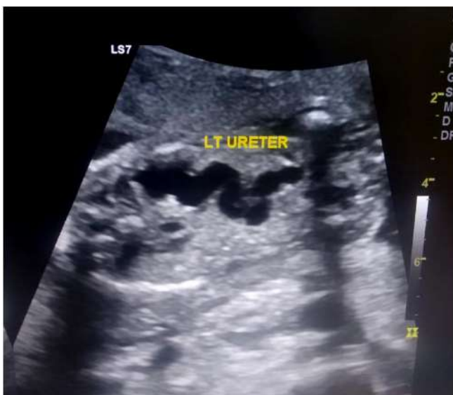
Fig 3: The left kidney shows grade III hydronephrosis with megaureter (10 mm)

Amniotic fluid volume was at a lower limit of normal range with AFI 8 cm. The abdominal wall was intact and the stomach bubble visualized. The placental location was posterior and 2 cm from the internal os. No evidence of craniovertebral junction anomaly was seen and the skull and spine appeared normal. The fetal heart was normal-sized, four chambered with apex formed by the left ventricle.