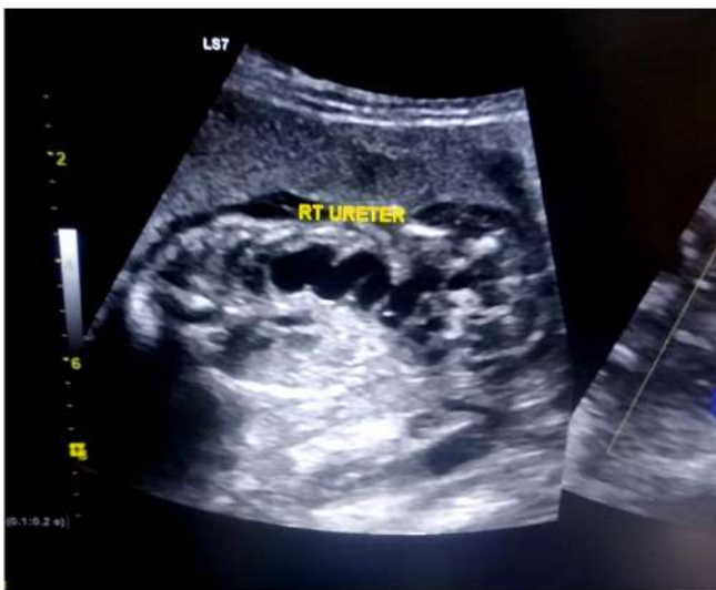
Fig 2: The right kidney showed hydronephrosis with dilated ureter (6mm)